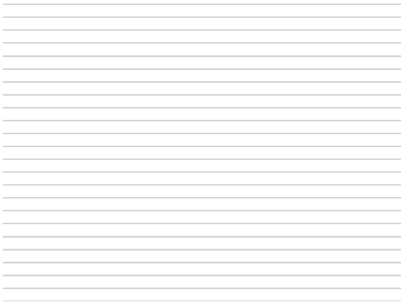
FIG.7: Relative variations of gate trigger current, holding current and latching current versus junction temperature