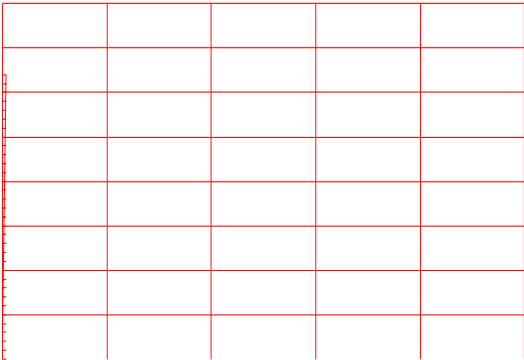
FIG.1: Maximum power dissipation versus RMS on-state current